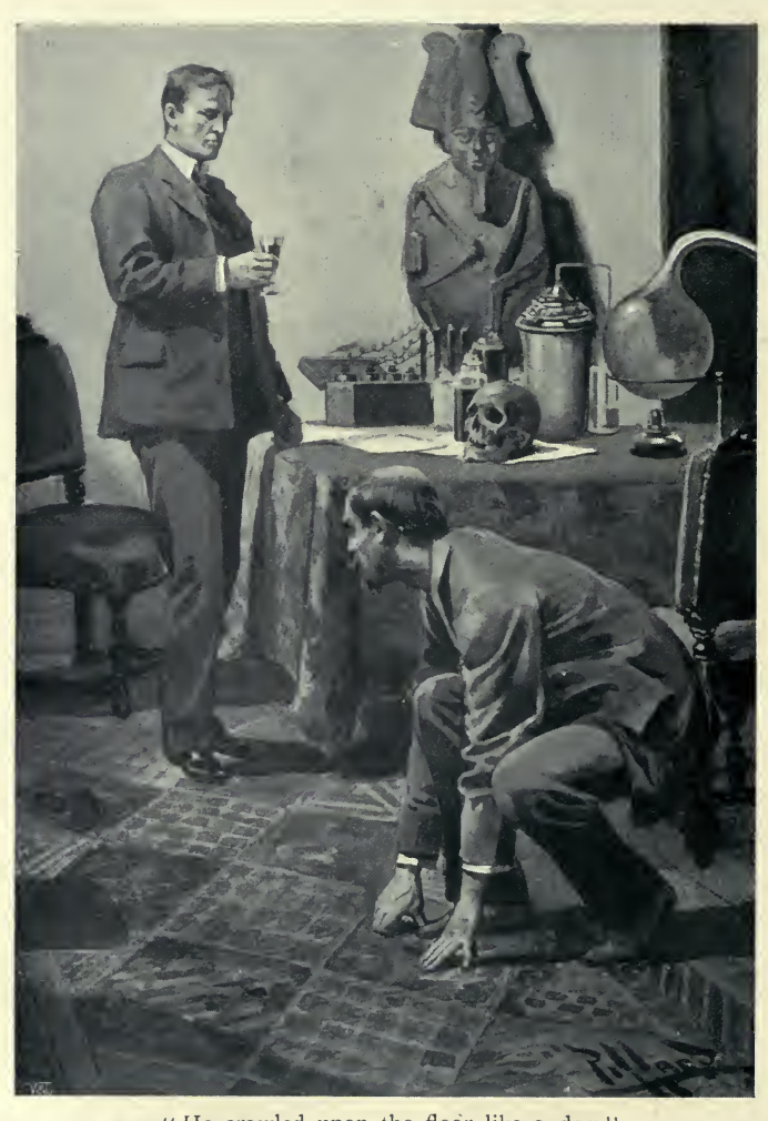
"He crawled upon the floor like a dog."